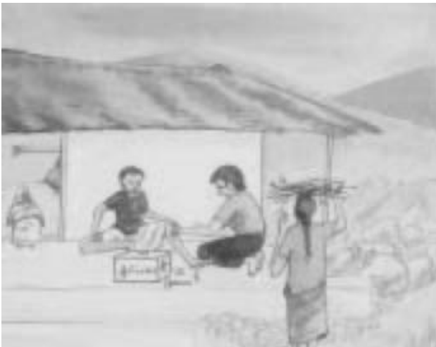
First Aid disaster management Team

Specialized training to the DMTs: Members of each Disaster Management Team will be trained on different activities to carry out their roles effectively.