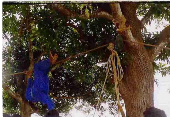
Mock Drill carried out by the village volunteers