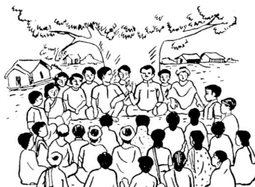
Meeting of the VDMC

Trained volunteers and PRI members will fix the day and time for village sensitization meeting and form the Village Disaster Management Committee. Villagers will select the members of VDMC as per their requirement. Anganwadi Worker, Male and Female Health Workers, Ward Members, School Teachers, member of youth clubs, women groups, ex-service men, any health practitioner, swimmers, gram rakhis, opinion leaders etc. could be the member of the VDMCs. VDMC will be responsible for development of the Village Disaster Management Plan, formation of Village Disaster Management Teams and to conduct mock drills. The VDMC too will be involved in formation of a Community Contingency Fund which will be used by the villagers in pre, during and post disaster. The contingency fund will be in a name of the VDMC and in each month from each household a fixed amount of money say Rs.5/- or Rs.10/- as decided by the villagers will be collected and deposited in the bank.